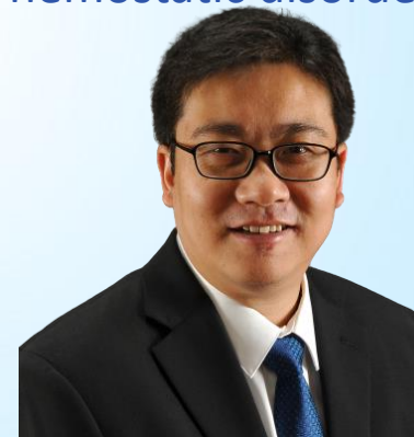
Prof. Wenman Wu [China]

The structure and function studies for clinical diagnosis of thrombotic and hemostatic disorders